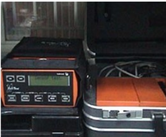
Helium Leak Test