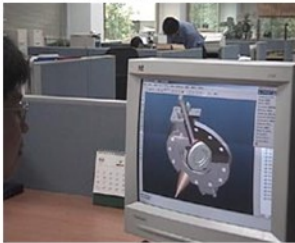
Pro E 3D