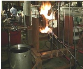
Fire Test Department