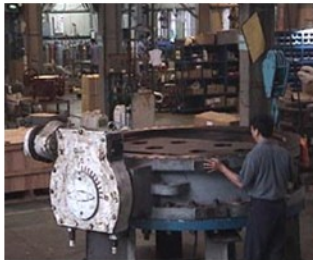
AWWA Test Facility