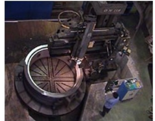
160" vertical Lathe