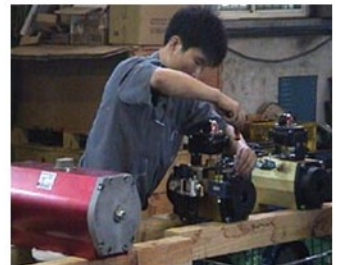
Control Valve Assembly